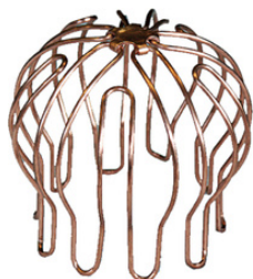
Copper Leaf Guard RO-LEAFGUARD-210-015-125-020-Z