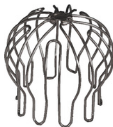
Zinc Iron Leaf Guard RO-LEAFGUARD-210-015-125-010-Z