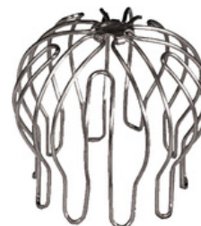
Stainless Steel Leaf Guard RO-LEAFGUARD-210-015-125-030-Z