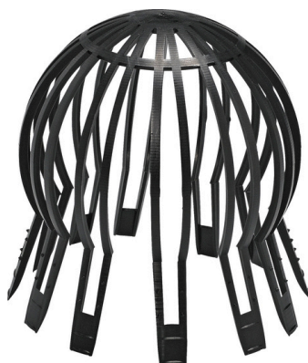
Polypropylene Leaf Guard RO-LEAFGUARD-210-020-080-125-Z