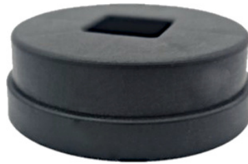
15mm Column Extender SP-ASP-SHANK015-Z